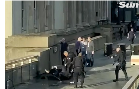
London, November 2019