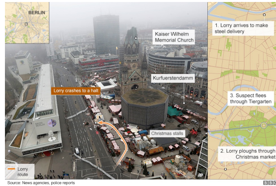
Berlin - December 2016