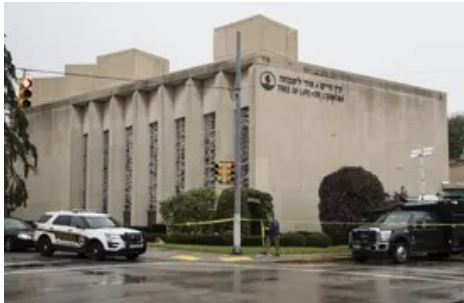
Three of Life synagogue Pittsburgh