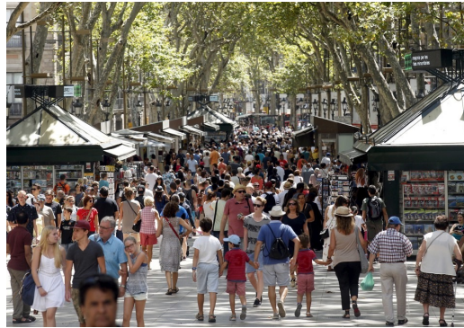
Barcelona - August 2017