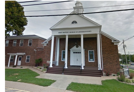
First Baptist Church Jeffersontown, KY