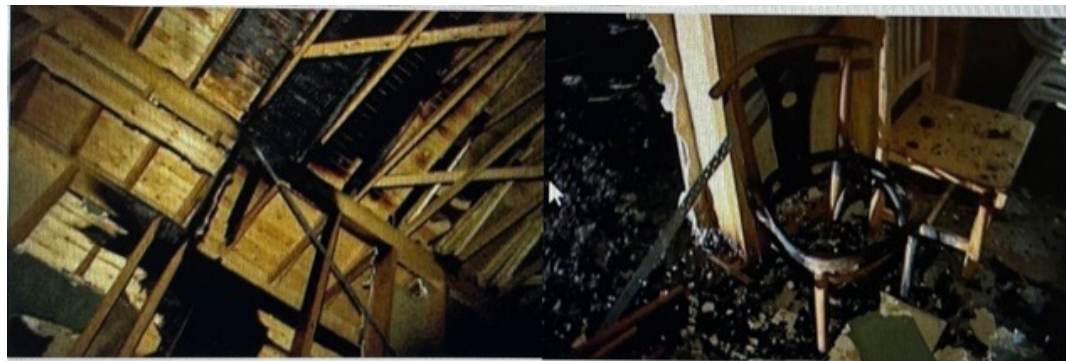
Finland - Buddhist temple Chùa Liên Tâm – Turku - 2010

– Stealing of money and valuable statues in January 2019 in several Buddhist temples near Helsinki , at the Finnish-Thai Buddhist temple in Nurmijärvi, at the Phuc Lam Vietnamese temple in Vantaa and Dai Tho Vietnamese temple in Kerava